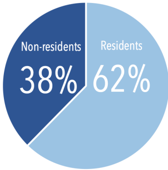
Figure 1: Proportion of non-resident attendees

About 116,800 attendees filled 215,873 seats at events over the course of the festival. An estimated 62% of attendees were Utah residents (about 72,800 individuals) while 38% came from out-of-state (about 44,000 individuals). About 34% of non-residents came from California, 11% from New York, 6% from Texas, 5% from Colorado, 4% from Illinois, 4% from Florida, 3% from Washington, and 34% from other states. Approximately 1% of non-resident attendees traveled from outside the United States to attend the festival, representing at least 36 different countries.